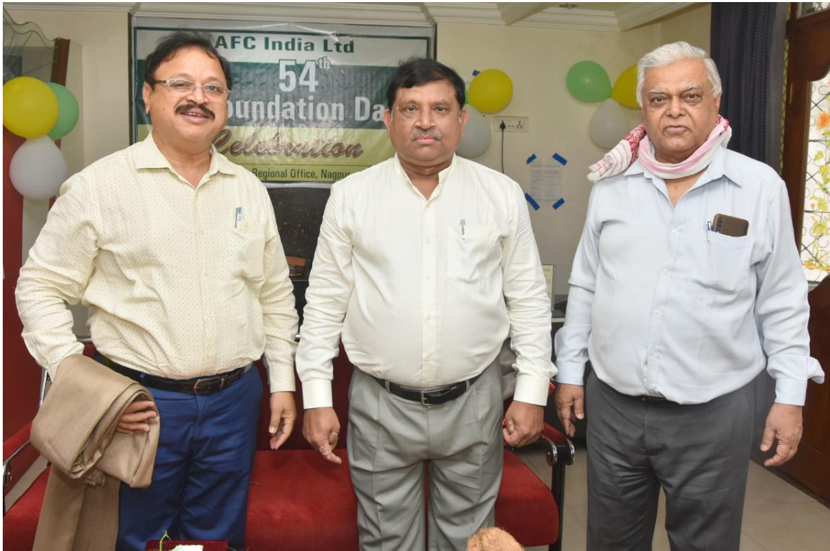
Photograph taken at AFC's Western Regional Office, Nagpur to commemorate the occasion of AFC's 54th Foundation Day