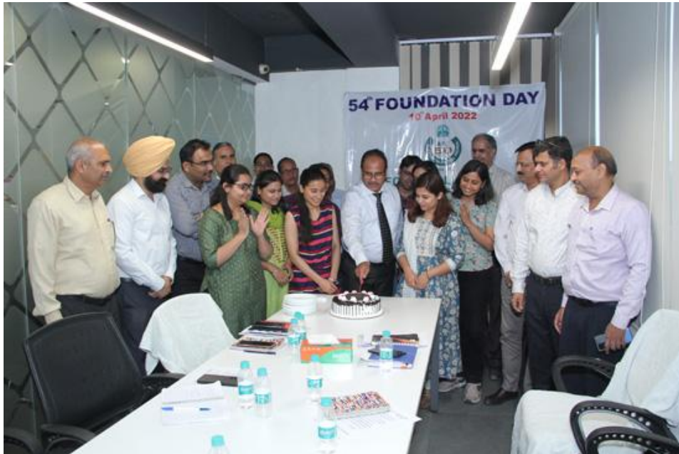
Cake Cutting ceremony to mark the occasion of AFC's 54 th Foundation Day at Corporate Office, New Delhi