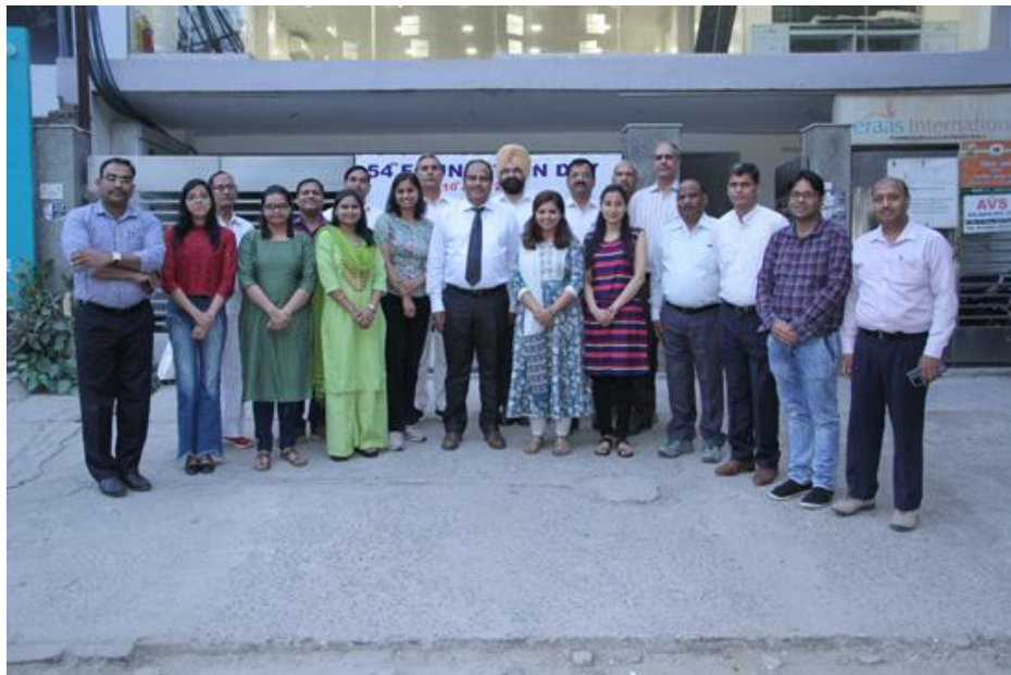
Group photograph taken at AFC's Corporate Office, New Delhi to commemorate the occasion of AFC's 54 th Foundation Day