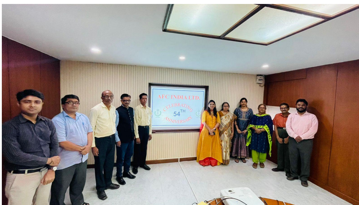
Group photograph taken at AFC's Registered Office, Mumbai to commemorate the occasion of AFC's 54 th Foundation Day