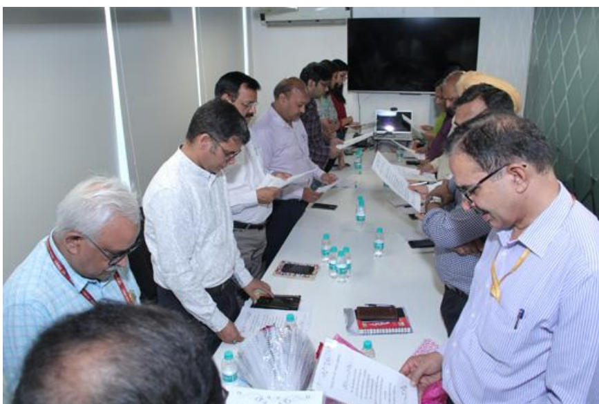
All AFC staff members taking AFC's pledge on the occasion of AFC's 54 th Foundation Day